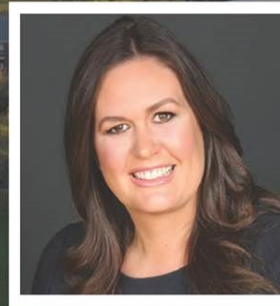
SARAH HUCKABEE SANDERS KEYNOTE SPEAKER

5:30 PM TO 6:50 PM DINNER & ENTERTAINMENT 7:00 TO 8:30 PM PROGRAM