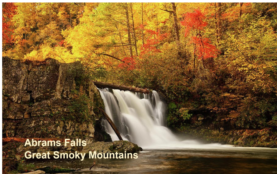
Abrams Falls Great Smoky Mountains