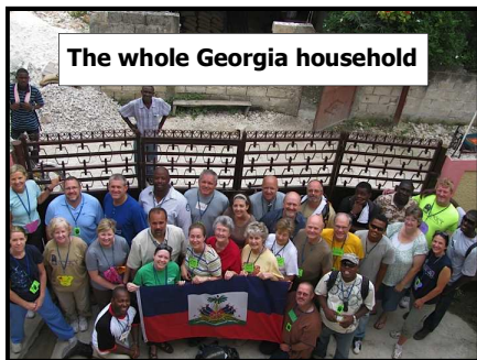
The whole Georgia household